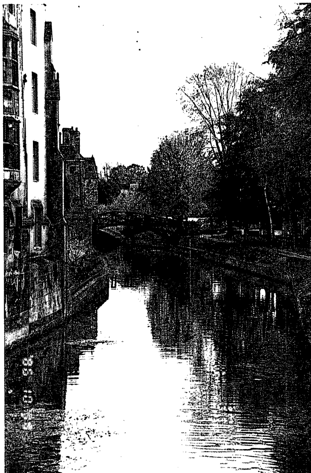
Mathematical Bridge, Queen's College, Cambridge, and the River Cam

of a place or reject the candidate. A conditional offer is normally dependent on the candidate's obtaining at least 2 A Level passes at stipulated grades in subjects relevant to the course applied for. It is very rare for a university to make an unconditional offer of a place. In August, when the A Level results are announced, candidates are anxious to know whether the grades they obtain match the conditions set down by their preferred universities. 9