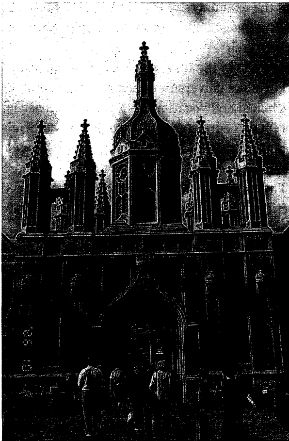
King's College, Cambridge

About 2,500 years ago Plato had the idea of university education and created in Athens the first University of the West, which was called the Academy and lasted for a thousand years. It set the course of educational development in Europe and even modern education bears the traces of his influence. Indeed Plato passionately believed that “societies, and therefore the individuals in them, could only prosper if human affairs were guided by systematic knowledge. It was essential that the ablest people of a community, those likely to fill leading roles in running it, should receive rigorous intellectual and moral training.” 5 Today a very large number of universities all over the world are still pursuing ideas similar to those of Plato. However, they face new problems because so much has changed since his time; advances in every branch of learning have been so large that no one can master it all, so that students concentrate on a particular subject which interests them or which they want to use in their future career. Indeed unless they specialize very narrowly, even what they learn will remain incomplete. But if universities merely prepared people for their future careers or