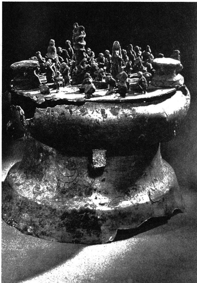
Fig.3 Bronze cowrie-container decorated with drum and a scene of offering human sacrifice.