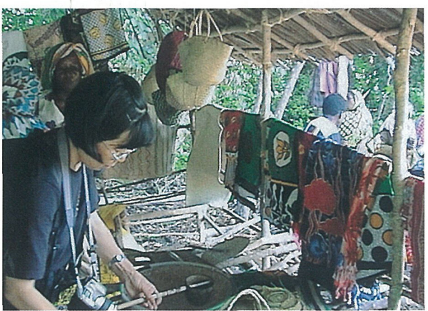
Fig.17: Women's handicrafts as souvenirs

The hut was filled with crafts handmade by local women and kanga clothes for retail. We bought some of them (Fig. 17), and the visit ended.