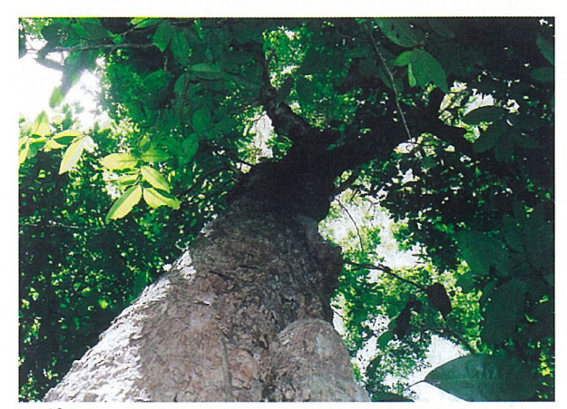
Fig.12: A very big tamarind tree.

Msapu is a very old cycad tree resembling a kind of palm (Fig. 13). It does not seem to change since Elder Mnyenze was very young. Digo people believe that it dates back to several centuries ago, when their first ancestors arrived here. According to an oral tradition, an ancestor, a fisherman, found its seedling on the beach, and planted it in front of his house. Every morning he