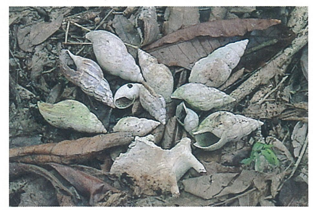
{\it Fig.14} : Conch shells consumed by Digo ancestors

There are many conch shells on the ground. They were consumed by Digo people who dwelt the kaya (Fig. 14).