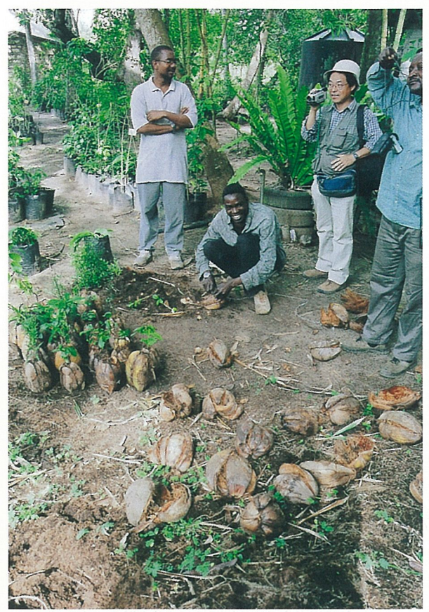
Fig.5: Nursery of CFCU