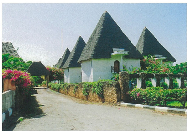
Fig.4: Nearby deluxe beach hotels

From Mombasa we took the Likoni ferry to the south, and after a drive of 29 kilometers, we came to the office of CFCU of National Museums of Kenya. On the beach there were many deluxe resort hotels, we asked the price of several beach hotels, but we could not afford the price of 150-500 US dollar per room per night, which could surpass the annual per capita income of an average Kenyan citizen. These were for Europeans and Americans who come to enjoy an exotic stay on the white beach (Fig. 4) . We were surprised to find a local newspaper published in the German language<sup>3)</sup>.