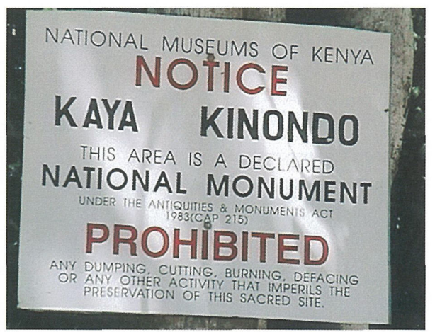
Fig.7: A plate for a National Monument

At the entrance of the Kaya Kinondo, a plate was nailed on a tree (Fig.7).