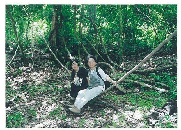
Fig.15: Nothing peculiar, but still fascinating!

Mwungo is a vine having sap used as gum. Its stem can be used as a rocking chair of the forest. Its fruits are sweet and edible. Roots are used to help women to have the strength of birth. Come and enjoy balancing on this vine (Fig 15).