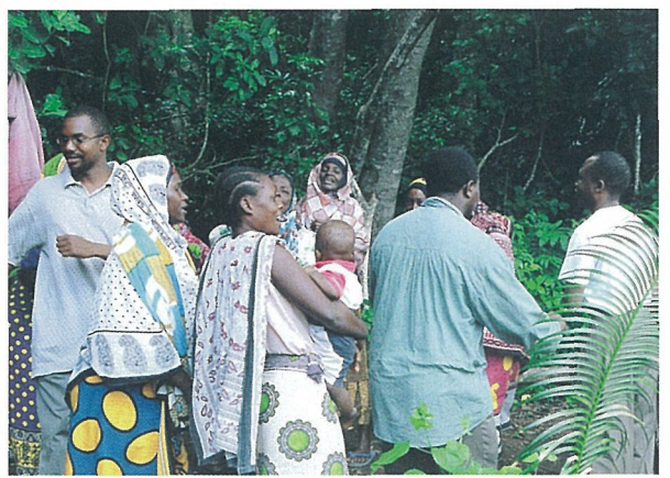
Fig.16: Enjoying dances with local women

The walk took about one hour and half. On our arrival to the gate, fresh coconut juice was served, and women welcomed us dancing. We happily joined the dance in a circle (Fig. 16).