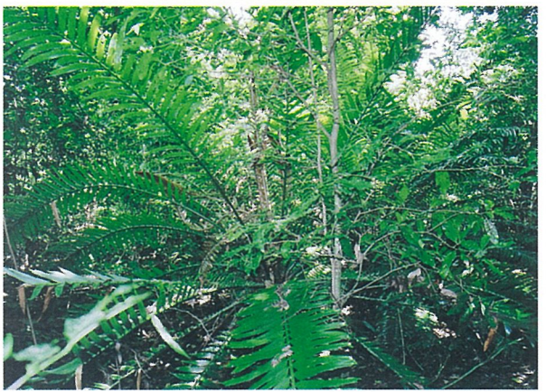
Fig.13: A cycad tree transplanted a long time ago

poured water on it after having washed his face. It continued to grow steadily, and has become the biggest tree of this species in Kenya. During a festival, we consume what we sacrificed, if there remains some leftover, we make it a rule to hang it on this plant and never take them out of the kaya.