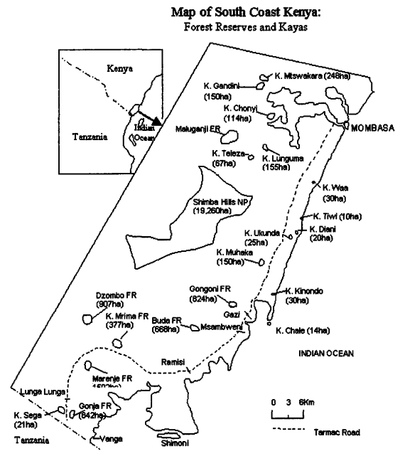
Fig.3: Map of South Coast Kenya. National Park, Forest Reserves, and Kayas (after htttp://www.colobustrust.org/)

clearings for fields and for pastures, and on the east coast, by the development of many deluxe resort hotels (Anonym, 2000).