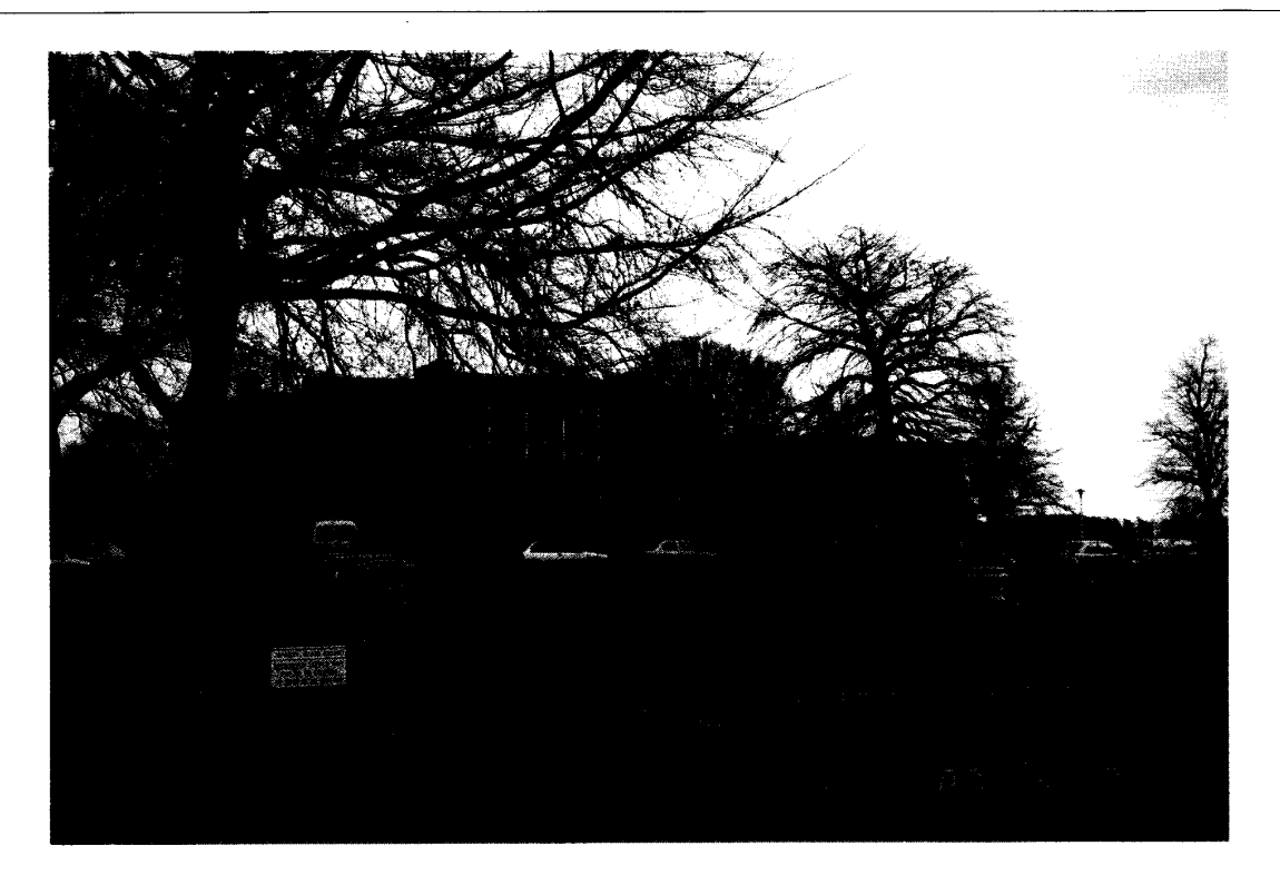
Impington Village College (Impington, Cambs.)

working at the local institutions, and the certificate is made use of by employers as well as by the applicants for a position. Furthermore, the certificate serves as one of the requirements for admission to a college of further education like Technical Colleges.